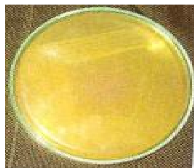
Oral isolate 4