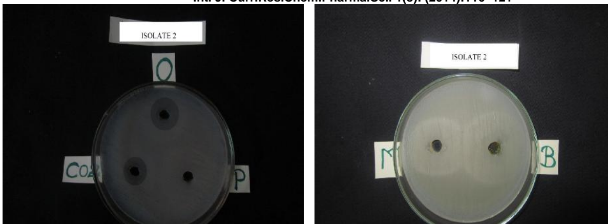
O – Pleurotus ostreatus , CO2 – Hypsizygyus ulmaris , P - Pleurotus platypus M - Calocybe indica , B – Agaricus bisporus