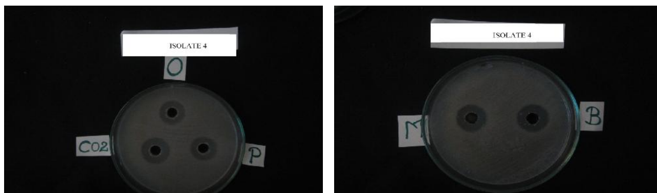
O – Pleurotus ostreatus , CO2 – Hypsizygyus ulmaris , P- Pleurotus platypus M- Calocybe indica , B – Agaricus bisporus