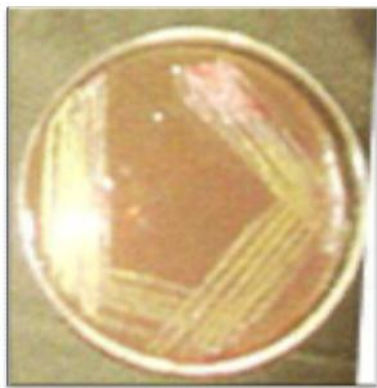
Oral isolate 1