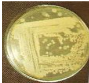
Oral isolate 2