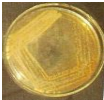
Oral isolate 3