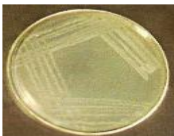
Plate 3: Effect of Aqueous Extract Of Mushroom Species on Oral Isolate 1