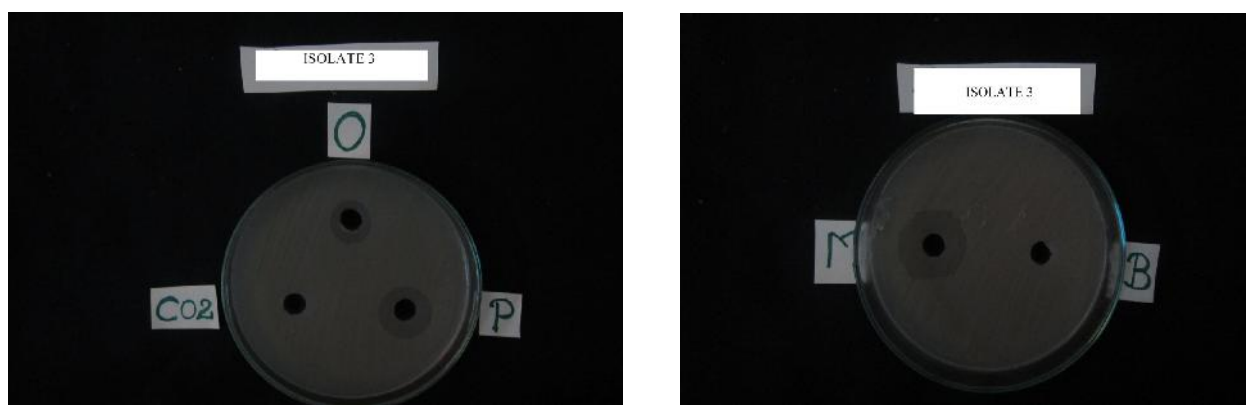
O – Pleurotus ostreatus , CO2 – Hypsizygyus ulmaris , P- Pleurotus platypus M- Calocybe indica , B – Agaricus bisporus