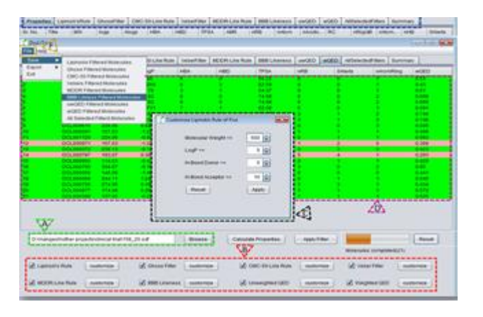
Fig 2.DruLiTo an open source virtual screening tool for calculating Drug-likness

Drug-likeness rules are set of guidelines for the structural properties of compounds, used for fast calculation of drug-like properties of a molecule. They can be quite effective and efficient. Using DruLiTo an open source virtual screening tool, we calculated druglikeness descriptors (fig 2).