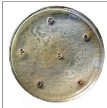
Plate 2 E. coli (gm –ve) Bacteria, effect of compounds AG-1 to AG-6