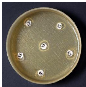
Plate 1 Proteus mirabilis (gm –ve) bacteria, effect of compounds AG-1 to AG-6